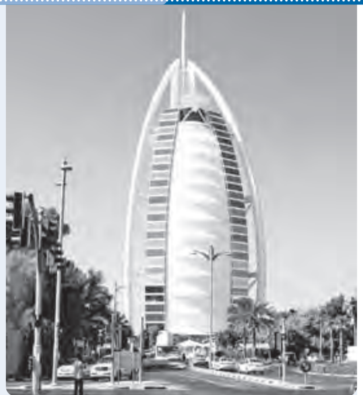
The hotel that's designed like a sail.