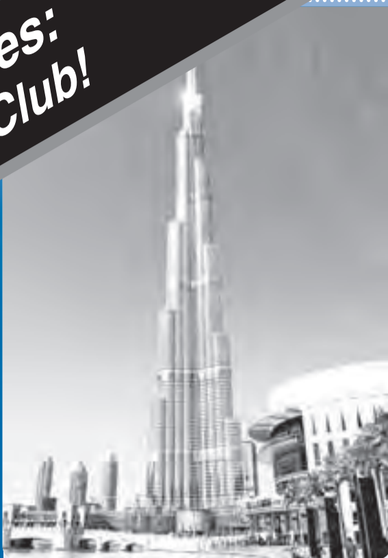
The world's tallest building.