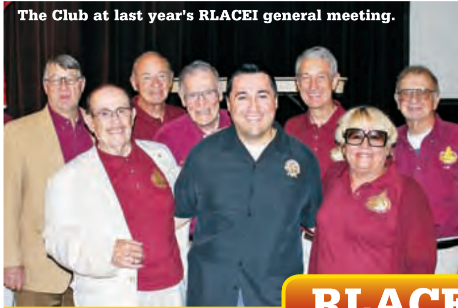
The Club at last year's RLACEI general meeting.