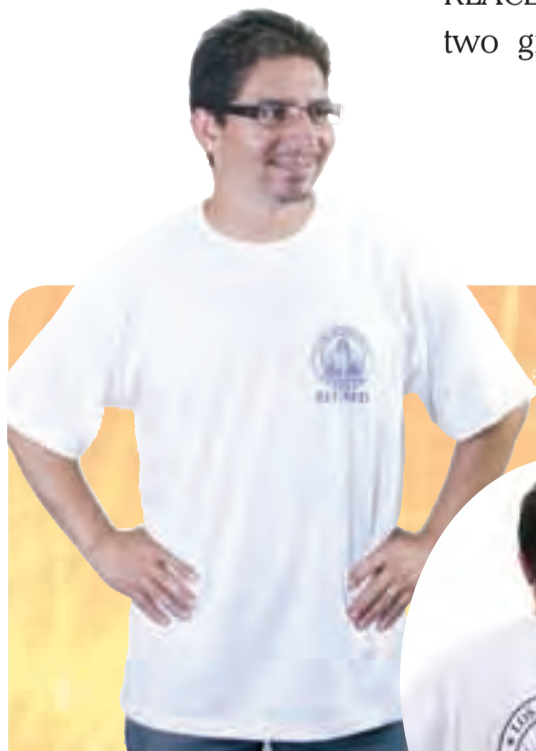
Retired City Employee T-Shirt