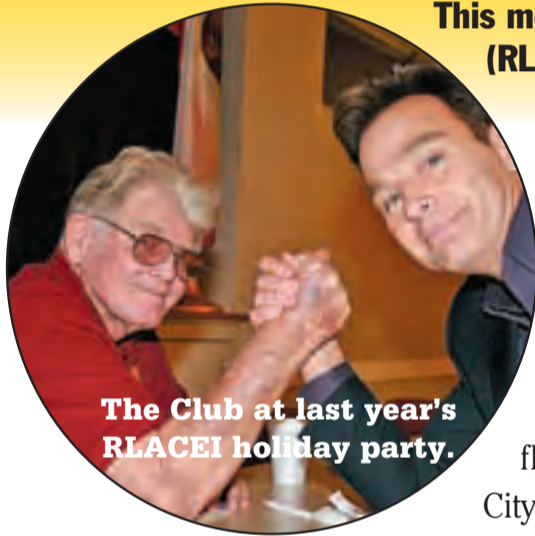
The Club at last year's RLACEI holiday party.

This month marks an important milestone for City Retirees who are also members of the RLACEI: Welcome to the Club!