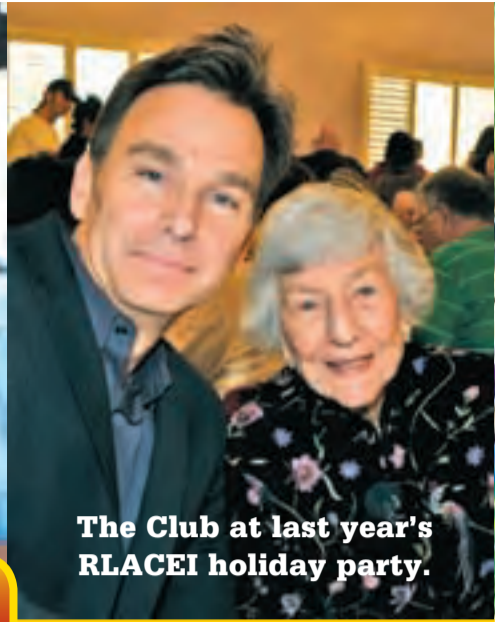
The Club at last year's RLACEI holiday party.