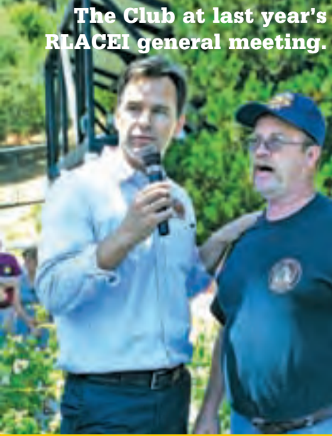
The Club at last year's RLACEI general meeting.