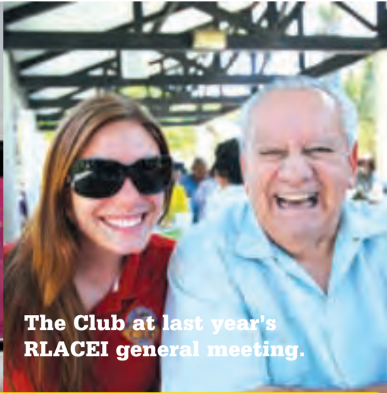
The Club at last year's RLACEI general meeting.