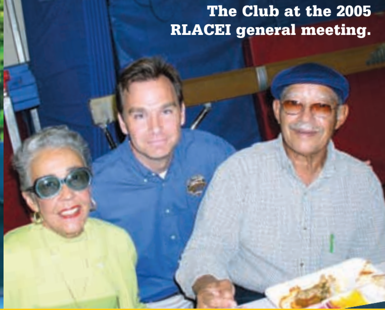
The Club at the 2005 RLACEI general meeting.