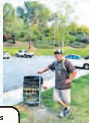
Above: The starting point at Laguna Lake.