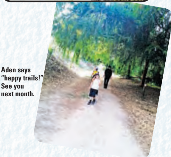
Aden says "happy trails!" See you next month.