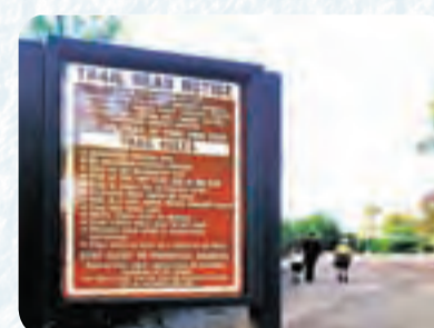
The trail head notice and trail rules.