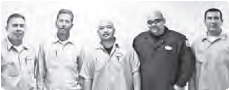
Congratulations to the new WTO I's!