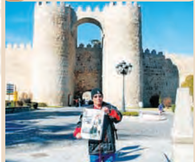
"I took this picture in Avila, Spain."