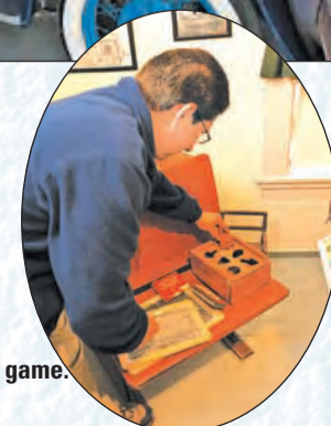
An antique game.