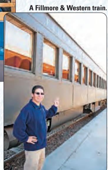
A Fillmore & Western train.