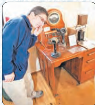
An antique telephone switchboard.