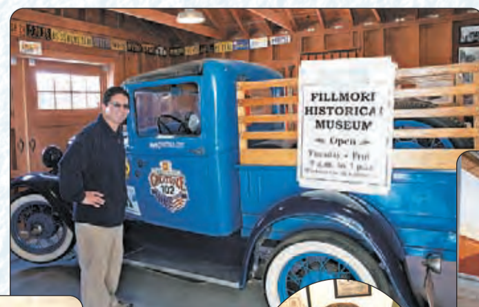
A Fillmore Great Race vehicle.