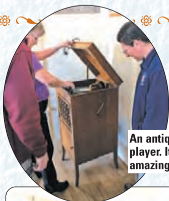
An antique record player. It sounded amazing.