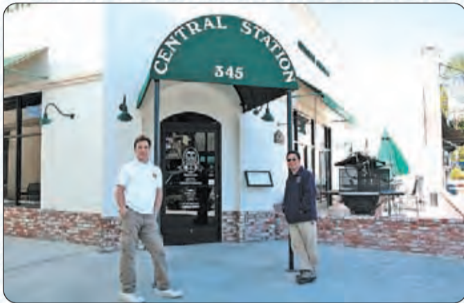
The Central Station Restaurant – great food and great service.