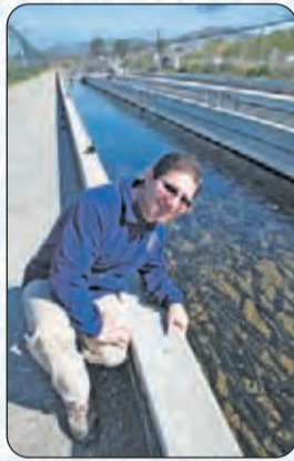
The fish, the bird, and me.