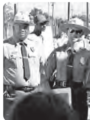
New Park Rangers are introduced.