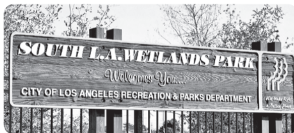
The opening of South Los Angeles' Wetlands Park.

Special thanks to Public Works for making the park a reality.