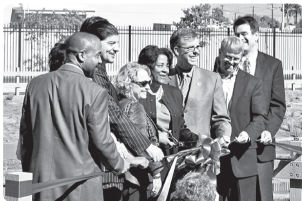
The official ribbon cutting – the park is now open!