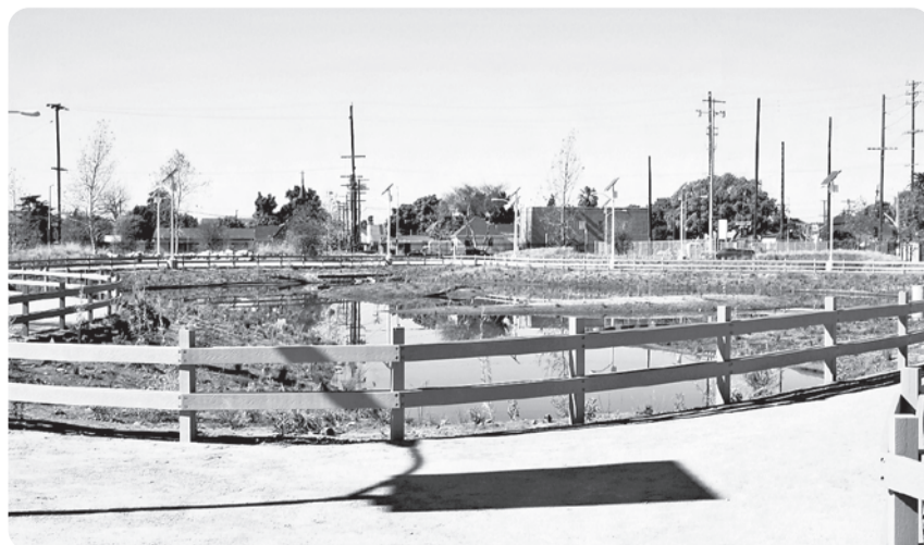
The water basin, walking path and surrounding vegetation.