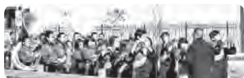
The Jefferson High School Band adds to the celebration.