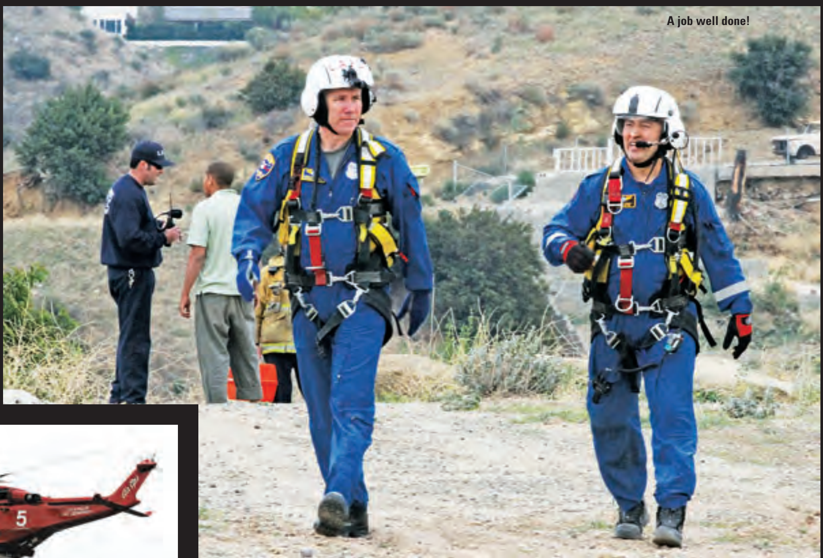
A job well done!