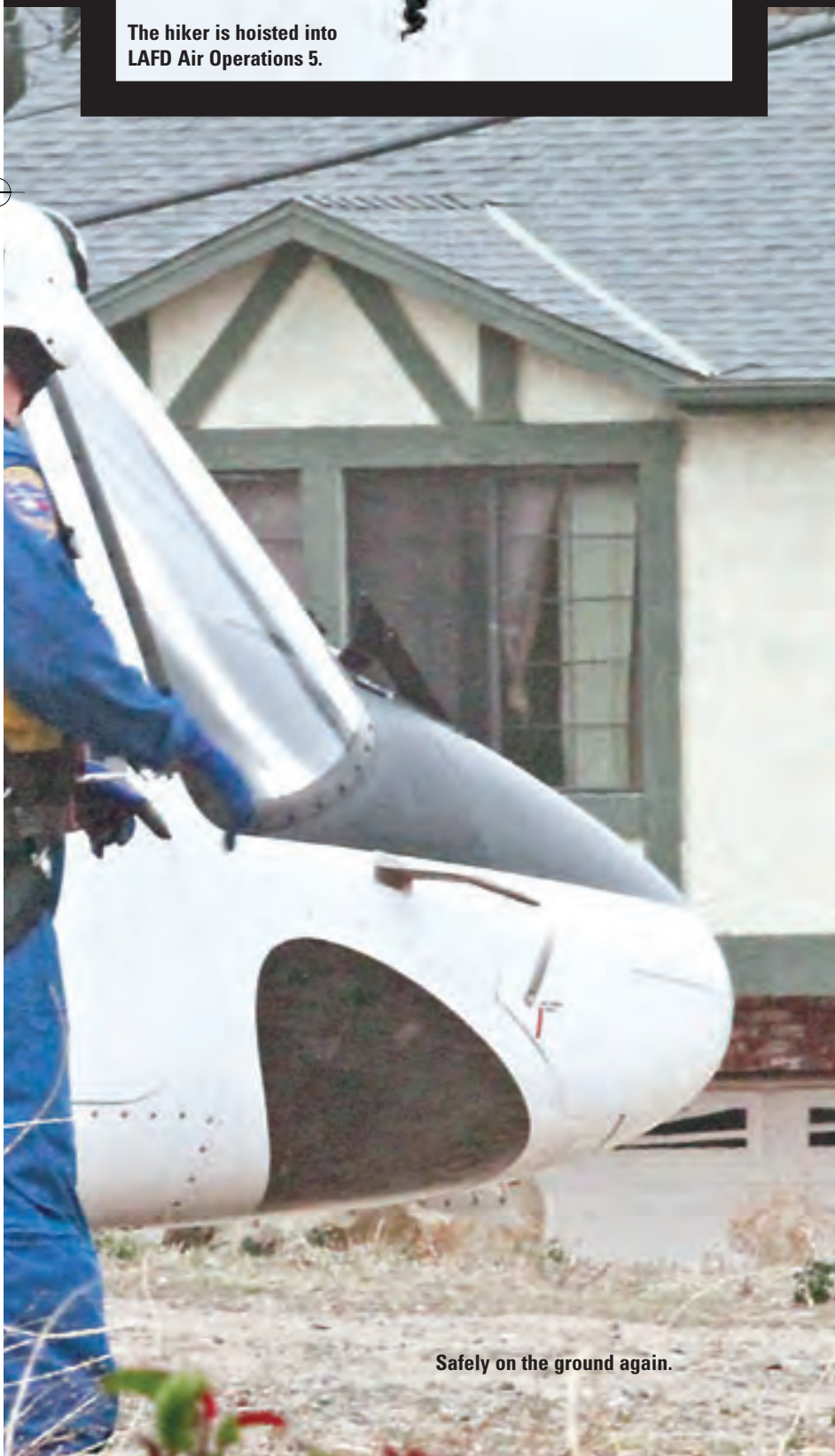
Safely on the ground again.