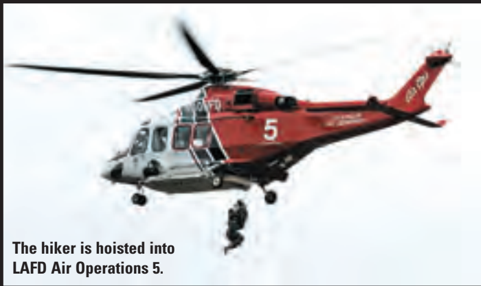
The hiker is hoisted into LAFD Air Operations 5.