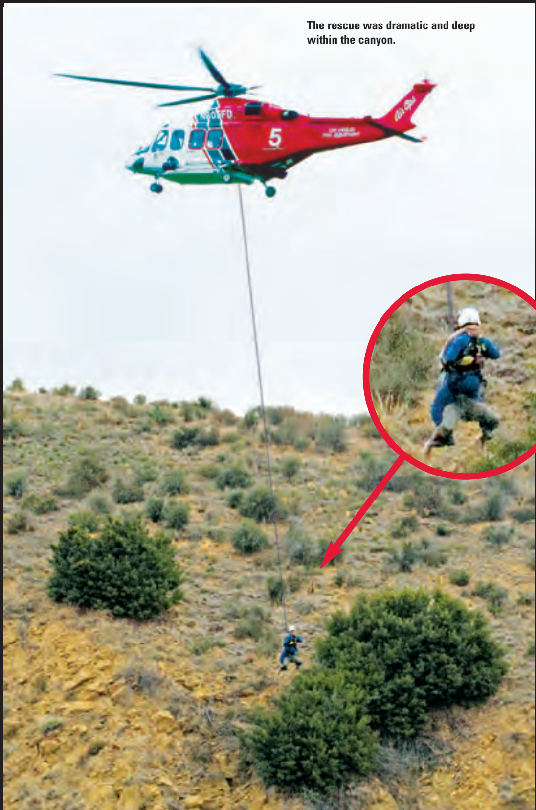
The rescue was dramatic and deep within the canyon.