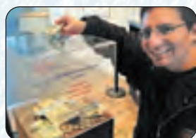
Donations are welcome.

DIRECTIONS: From Downtown Los Angeles find your way to Sunset Boulevard and continue north until the street turns