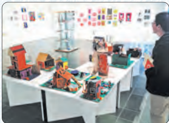
Junior Art Center.