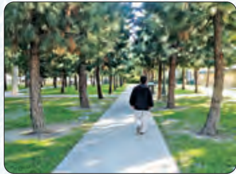
One of the walkways in Barnsdall Park.