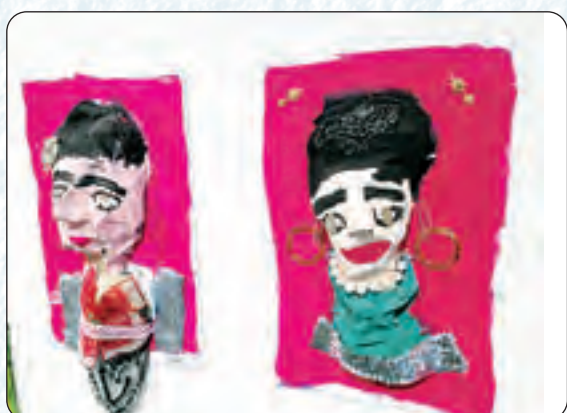
One of my favorite displays.