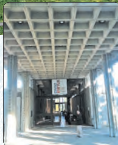
The entrance to the art gallery.

Frank Lloyd Wright, who designed Hollyhock House, is America's best-known architect. Born in 1867, he lived