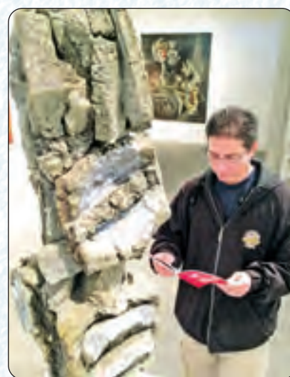
Sculpture, 1961, stoneware and glaze.

to be 91. Prime examples of his work include the prairie houses, the S.C. Johnson Wax Building, Fallingwater and the Guggenheim Museum. Wright was gone for most of the Barnsdall project construction, but he entrusted supervision to two young men who would later be Los Angeles prominent architects, his apprentice Rudolph Schindler and his son Lloyd Wright.