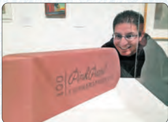
Eraser, 1970, balsa wood and paint.