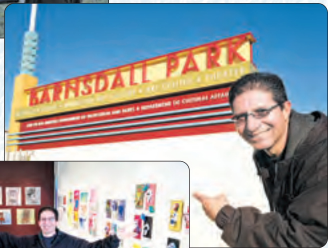
Above: Barnsdall Art Park entrance.