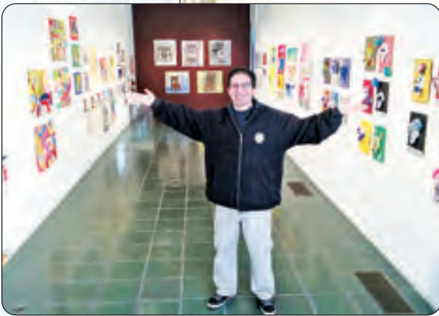
Left: Colorful exhibits from children.