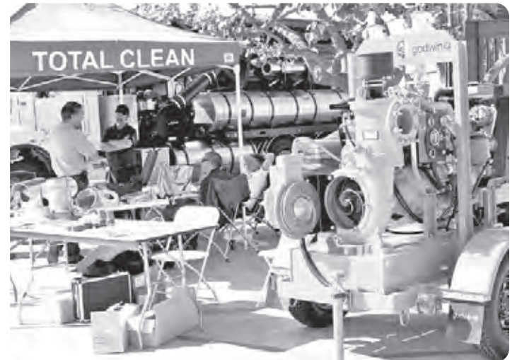
One of the pieces of collection equipment on display is a transfer pump, used to bypass sewers and pump water and debris.