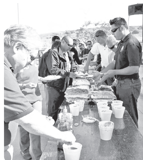
Attendees line up for a delicious catered meal.