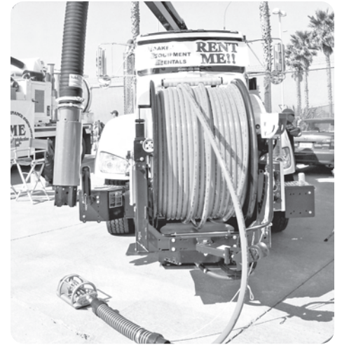
Combination machines (trucks), which clean and vacuum out waste systems.