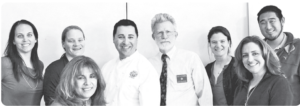
The chili cookoff judges.