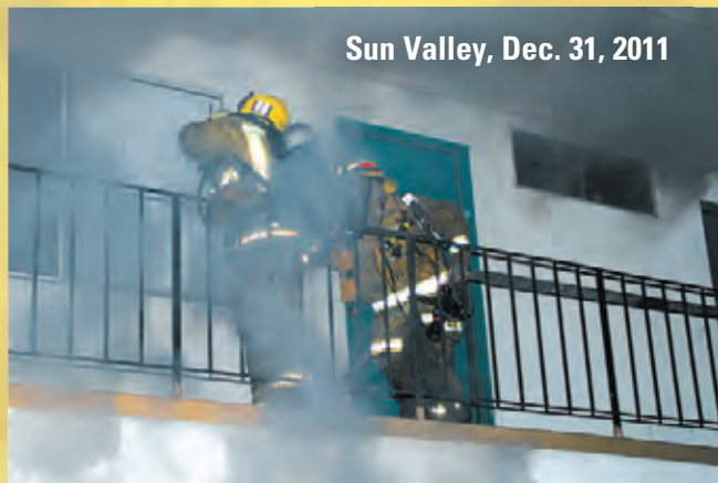
Sun Valley, Dec. 31, 2011