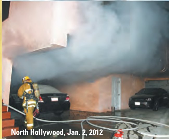
North Hollywood, Jan. 2, 2012