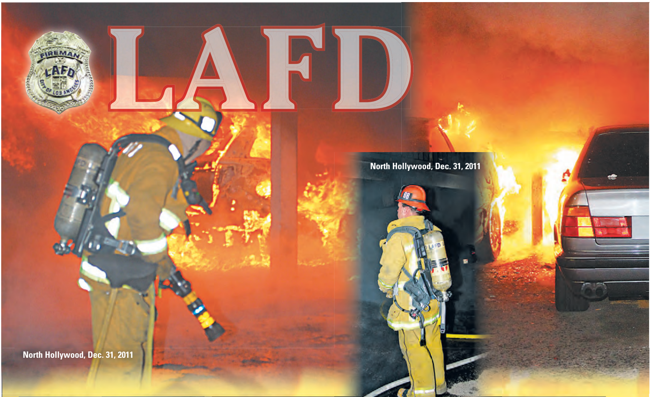
North Hollywood, Dec. 31, 2011