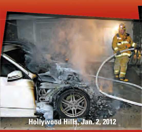
Hollywood Hills, Jan. 2, 2012