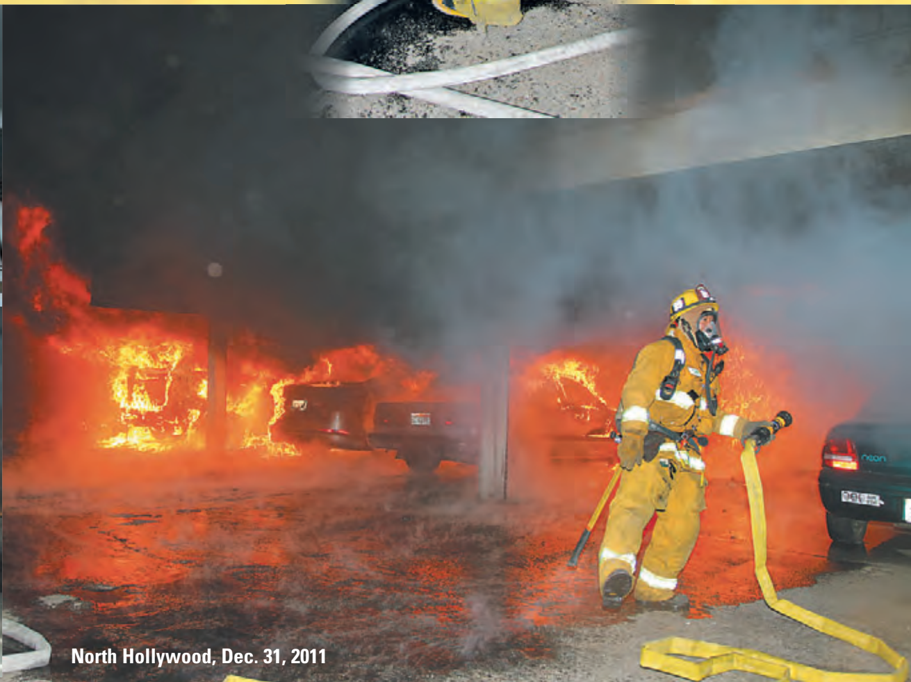
North Hollywood, Dec. 31, 2011