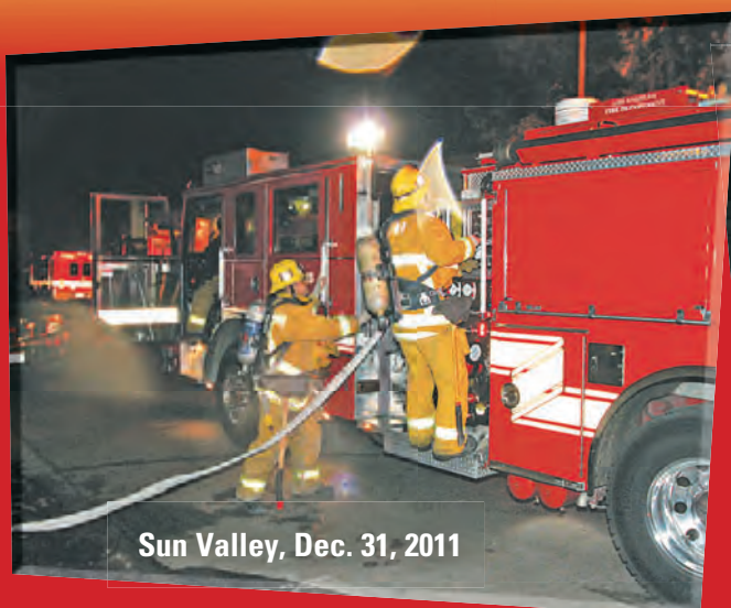
Sun Valley, Dec. 31, 2011