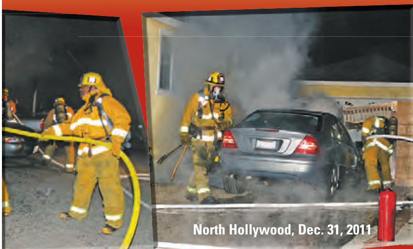
North Hollywood, Dec. 31, 2011

“From the very first fire on Dec. 30, when we first determined what we were facing, the Los Angeles Fire Department along with the Los Angeles Police Department, the Los Angeles County Fire and Sheriff’s Department, the District Attorney’s Office and Federal Bureau of Alcohol, Tobacco, Firearms and Explosives began working around the clock to apprehend this arsonist and insure the safety of our community. We are grateful for the trust and support of the public.”