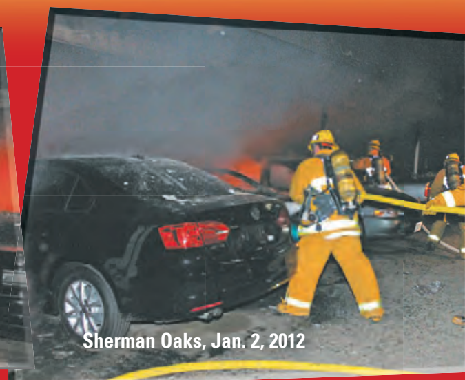
Sherman Oaks, Jan. 2, 2012