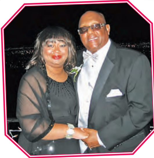
"Thank you Pooh-Pooh for 14 wonderful years of marriage. Love, Pooh-Pooh."