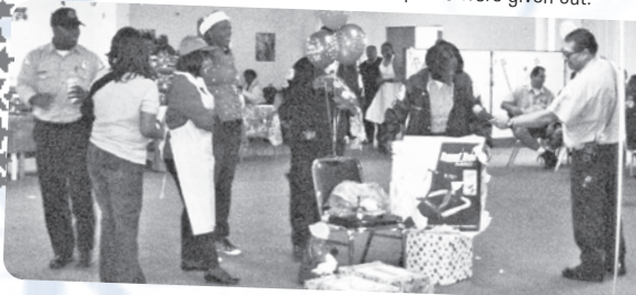
Raffle and prizes were given out.