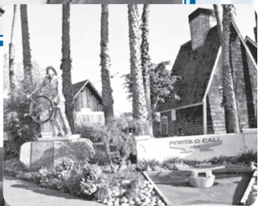
Ports O' Call in San Pedro.