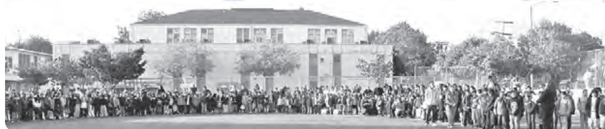
Hello Murchison Elementary.