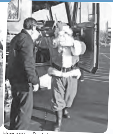
Here comes Santa!