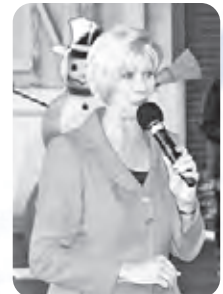
Congresswoman Janice Hahn, Club Member, shares holiday greetings.