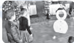
Kids have fun with a bean toss game.