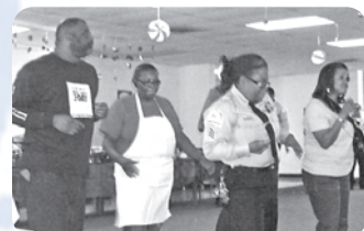
Doing the "Wobble."