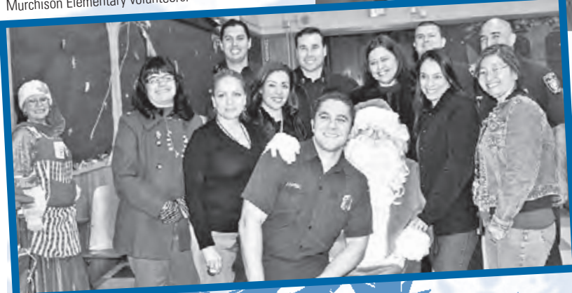
Murchison Elementary volunteers.