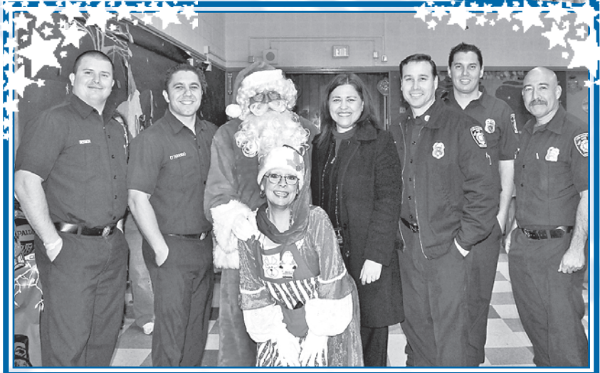
Fire Station 2, Mr. and Mrs. Claus, and the principal!