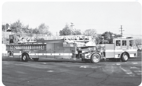
Fire Station 2 presents.