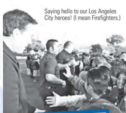
Saying hello to our Los Angeles City heroes! (I mean Firefighters.)