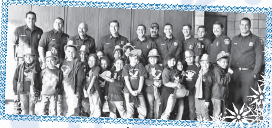
Dolores Mission's third-grade class with Fire Station 2 personnel.