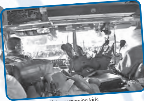
Approaching all the screaming kids.