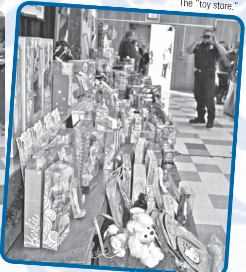
The "toy store."