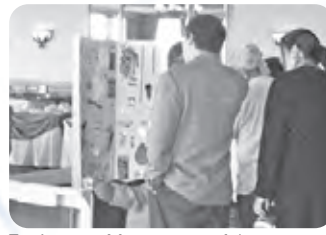
Testing your Memory, one of the games employees enjoyed at the party.