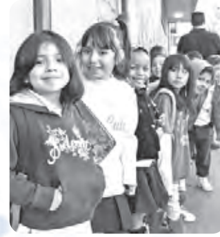
Waiting to see Santa.