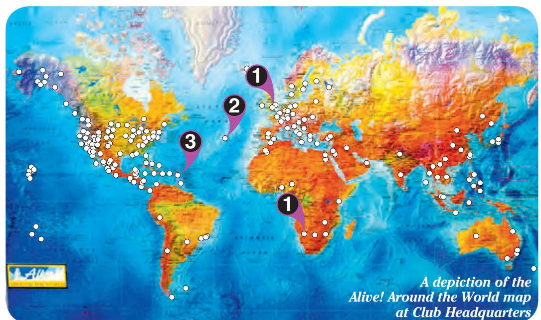
A depiction of the Alive! Around the World map at Club Headquarters

The Alive! Around the World Map at Club Headquarters