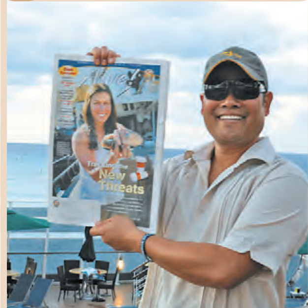
"Here is a picture of me somewhere in the Atlantic Ocean during my eastern Caribbean cruise right after Thanksgiving."