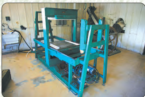
An apple cider machine.