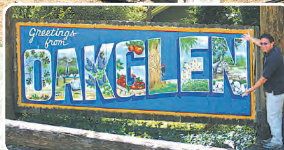
Greetings from Oak Glen.

During our trip, we started wondering, could we see one of the farms in action? And as luck would have it, we got only halfway there. The owners of Snow-Line Orchards took us through the Snow-Line Cider Mill and showed us the actual equipment used to produce apple