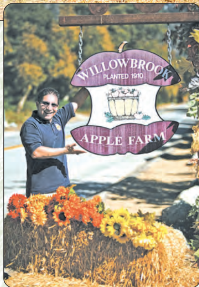
Willowbrook Apple Farm.