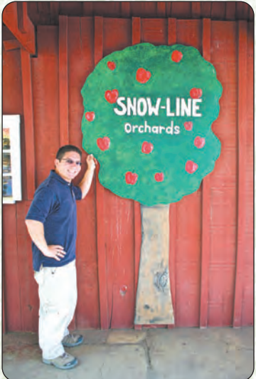
Snow-Line Orchard's "apple tree."

BELOW: In front of Los Rios apple stand.