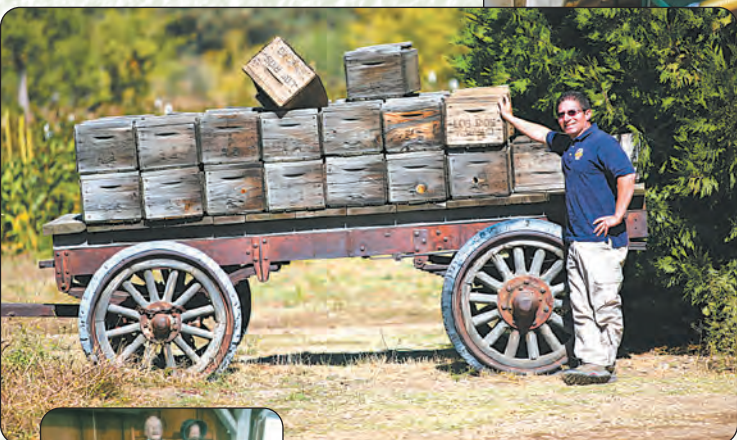
An antique steel and wooden wagon carrying Los Rios crates.