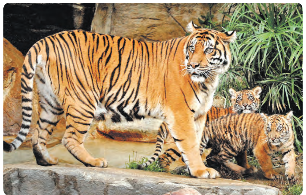
Sumatran tiger cubs (at right in photo).

Sumatran tigers are listed as endangered by the International Union for Conservation of Nature (IUCN). The carnivores are found only on the Indonesian island of Sumatra and require a habitat dense in vegetation, in order to hide and ambush their prey, and a reliable source of water. Continued agricultural habitat destruction, poaching, and killing of tigers that come into contact with villagers, all intensify the crises surrounding tigers.