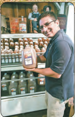
Snow-Line's famous apple cider.