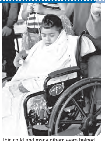
This child and many others were helped by this excellent event.