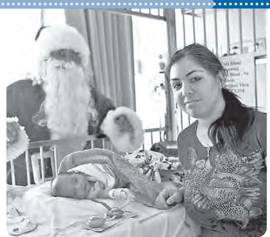
Santa helps out an infant.