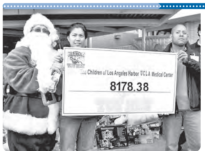
The event raised $8,178.38, in addition to the toys