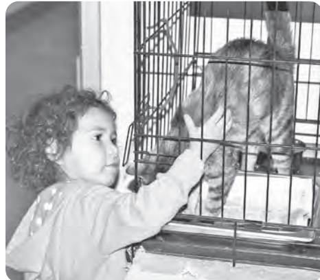
A little girl from the community drops in to pet the "kitties."