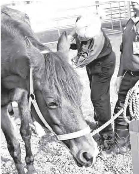
West Valley Shelter cares for and has available for adoption unusual pets including horses and chickens.