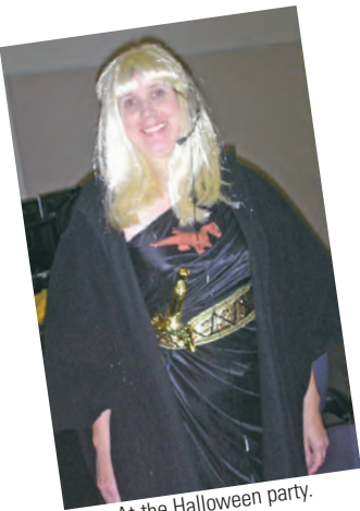
At the Halloween party.