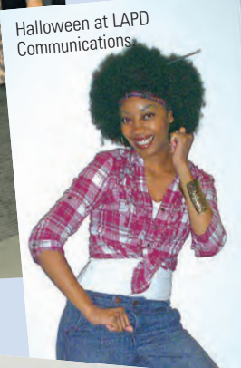
Halloween at LAPD Communications