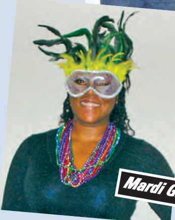
Mardi Gras time!