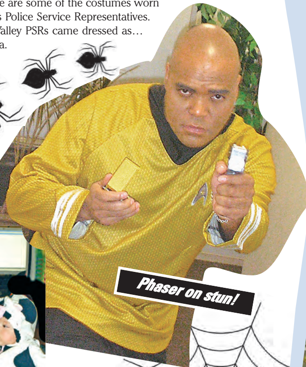
Phaser on stun!