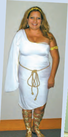
At the Halloween party.