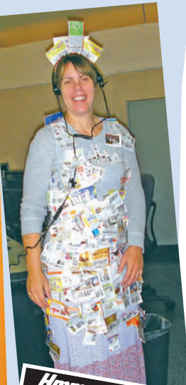
Hmmmm, we're stumped.