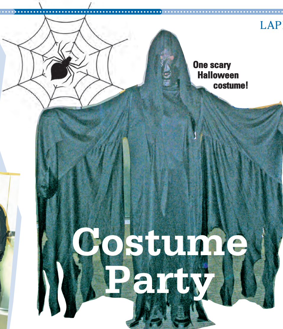
One scary Halloween costume!