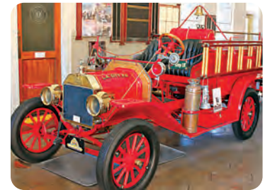
A museum fire truck.