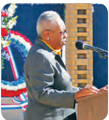
Fire Commissioner Genethia Hudley-Hayes.