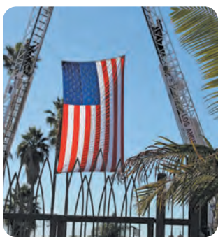
The American flag was flown in remembrance.