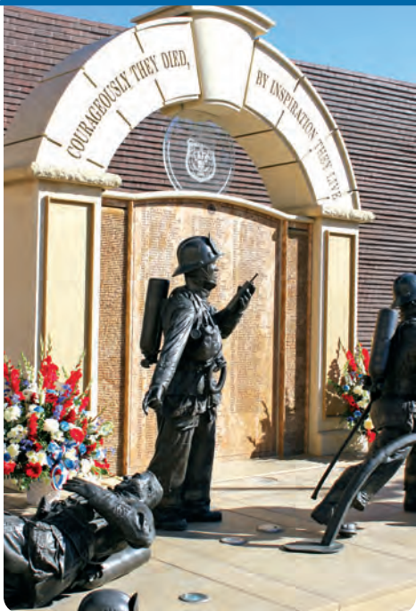
Roses were placed at the base of the memorial by families and friends of the fallen firefighters. The inscription reads: "Courageously they died, by inspiration they live."