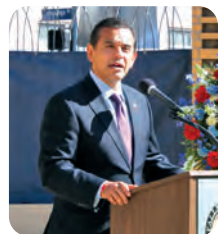
Mayor Antonio Villaraigosa.