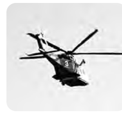
A flyover by the LAFD Air Ops.

Fire Dept. hosts golf tournament for the Fireman's Relief Fund.