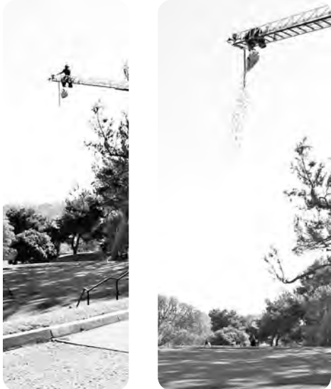
The ball drop.