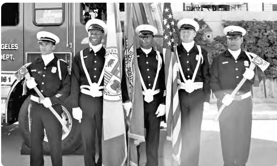
The color guard at the opening ceremony.