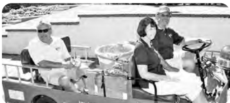
Covering the routes. Refreshments for everyone.