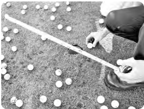
Winners of the ball drop.