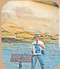
"Supernova Pictograph gets its name from the star/crescent imagery in the rock art on the overhang behind me."