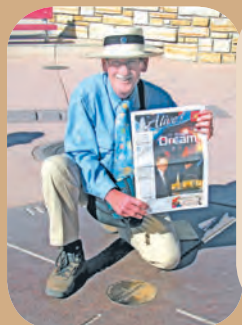
"This picture has me centered at Four Corners Monument, where the corners of four Western states all meet in celebrated perpendicularity."