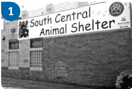
Animal Services' South Central Animal Shelter.

Club Counselor adopts a pet from Animal Services' South Shelter and meets the shelter's employees.