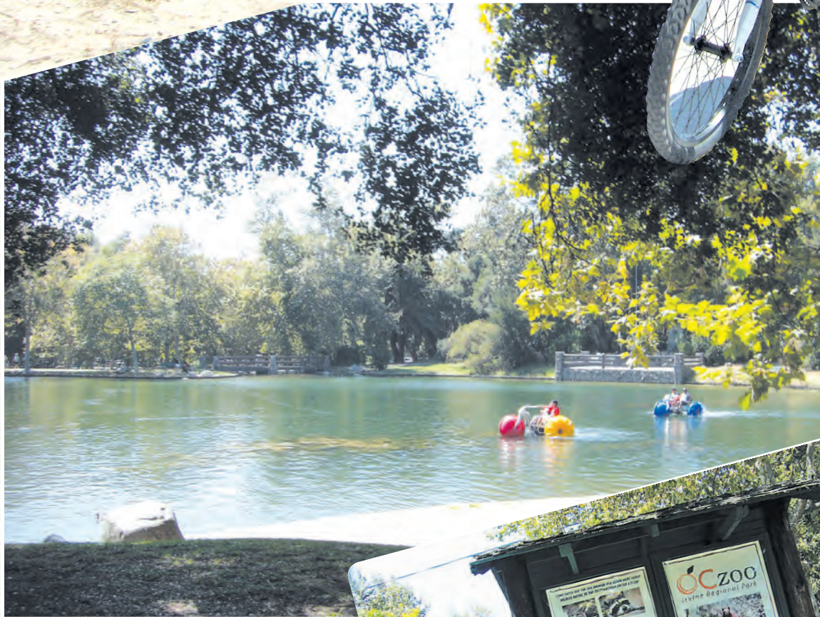
Paddleboats at Irvine Park.

The park underwent a major renovation and redevelopment in 1982-83. This included restoring the old buildings; redevelopment of the three group picnic areas; addition of three playgrounds and horseshoe pits; new turf and landscape; and relocating the roadways. A new zoo facility was also constructed,