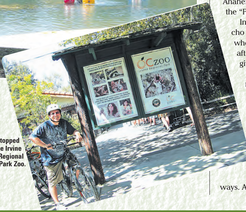
We stopped by the Irvine Regional Park Zoo.