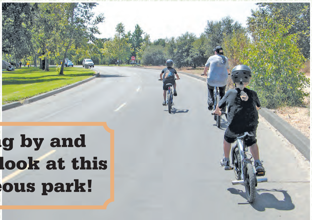
Enjoying a beautiful day outside.

Swing by and take a look at this gorgeous park. Even if you do not bike ride, you can hang out fishing,