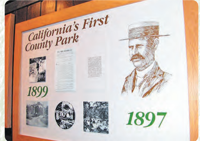
Irvine Regional Park, "California's first county park."