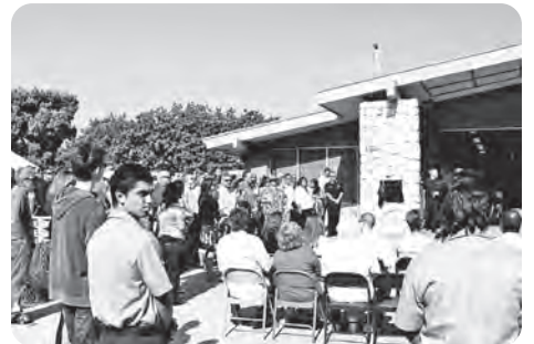
Community and Fire Department members.