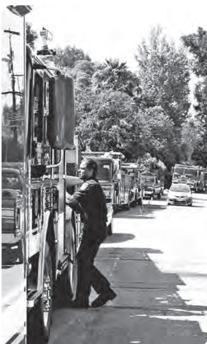
All the engines lined up in honor of fallen Firefighter Glenn Allen.