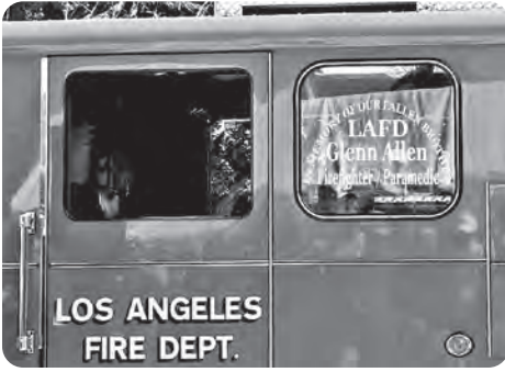
Engine 97, in remembrance of Firefighter/Paramedic Glenn Allen.