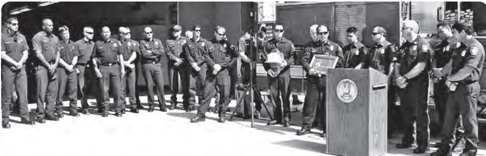
First Alarm Assignment to Viewsite Fire: Engine 41, LA County Engine 7, Light Force 78 and Engine 97.