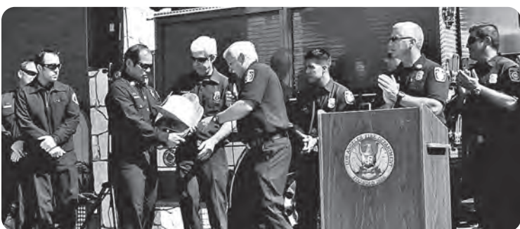
Los Angeles County Fire, Engine 7, receives its Helmet Plaque for the generous contribution and support of LAFD members involved in the Viewsite Fire.