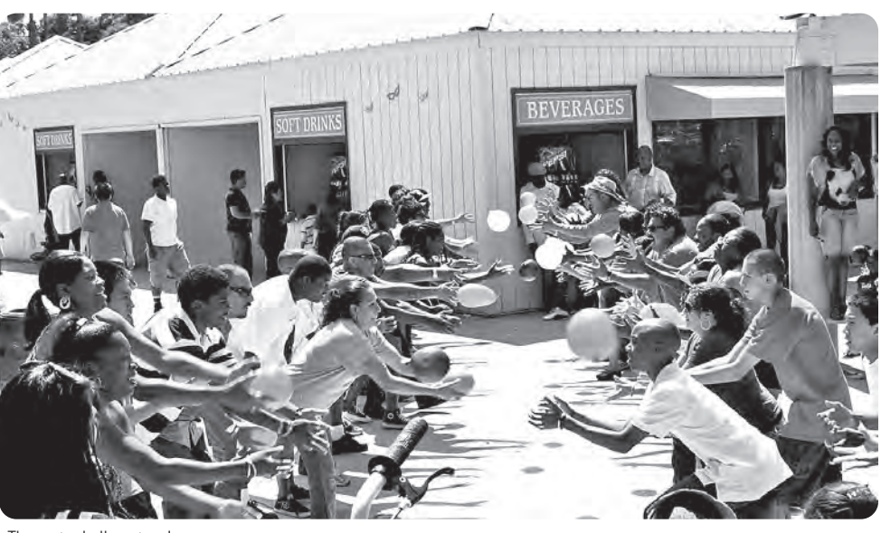
The water balloon toss!