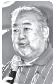
State Sen. Ted W. Lieu, 28th District.