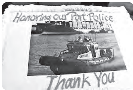
The cake that helped honor the Port Police.