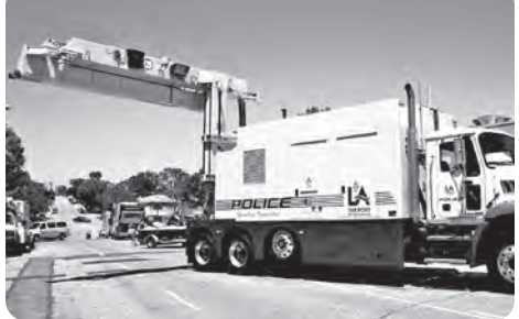
The X-ray truck was one of the many Port Police displays available for the public to see.