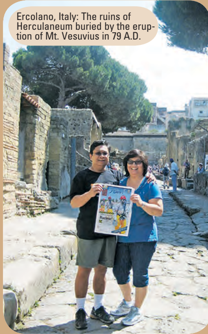
Ercolano, Italy: The ruins of Herculaneum buried by the eruption of Mt. Vesuvius in 79 A.D.