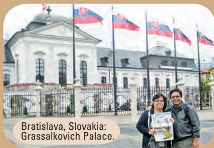
Bratislava, Slovakia: Grassalkovich Palace.