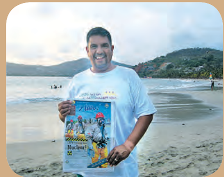
"Here are two shots from our last vacation to Mexico. The one at the beach is in Playa la Ropa, Zihuatanejo, Guerrero. The second one is in front of the Monumental Plaza Mexico, in Mexico City. I believe it's the largest bullfighting ring in America."