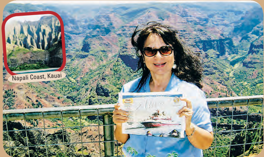
Napali Coast, Kauai