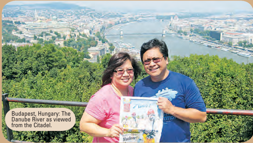
Budapest, Hungary: The Danube River as viewed from the Citadel.