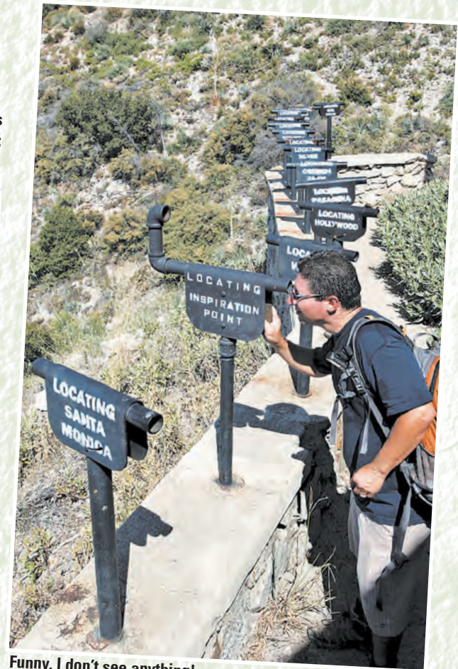
Funny, I don't see anything!