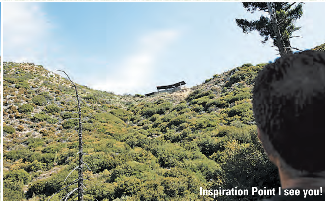
Inspiration Point I see you!