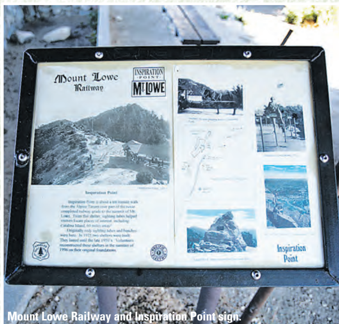
Mount Lowe Railway and Inspiration Point sign.

You can't really see the Inspiration Point pavilion until you're almost there. So when you've just about lost your motivation, you get it all back again in one nice visual. If you just keep moving, even if they are smaller steps, you will reach your ultimate goal, Inspiration Point. You need to do this, it is truly inspirational! Got for it!