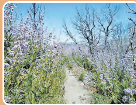
Lookout for this Poodle-Dog Bush!