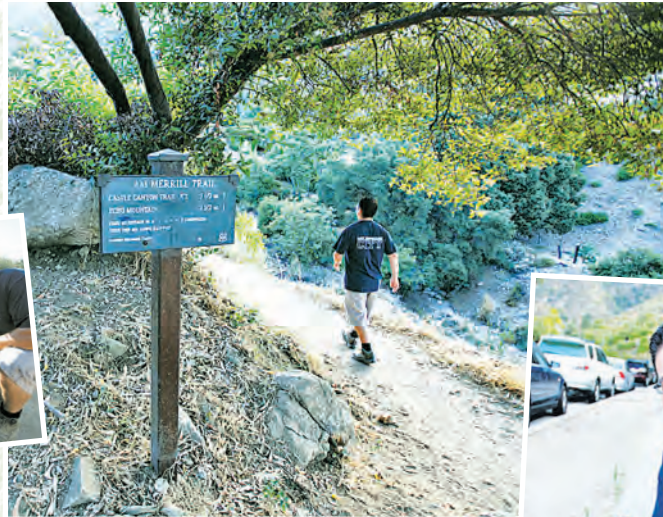
Sam Merrill Trail sign and information.

You should always have these with you: water, safety gear, sunscreen and snacks.