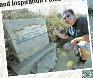
Castle Canyon Trail and Inspiration Point.