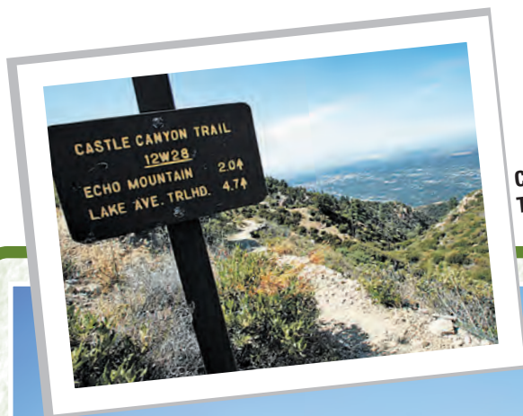
Castle Canyon Trail, going down.