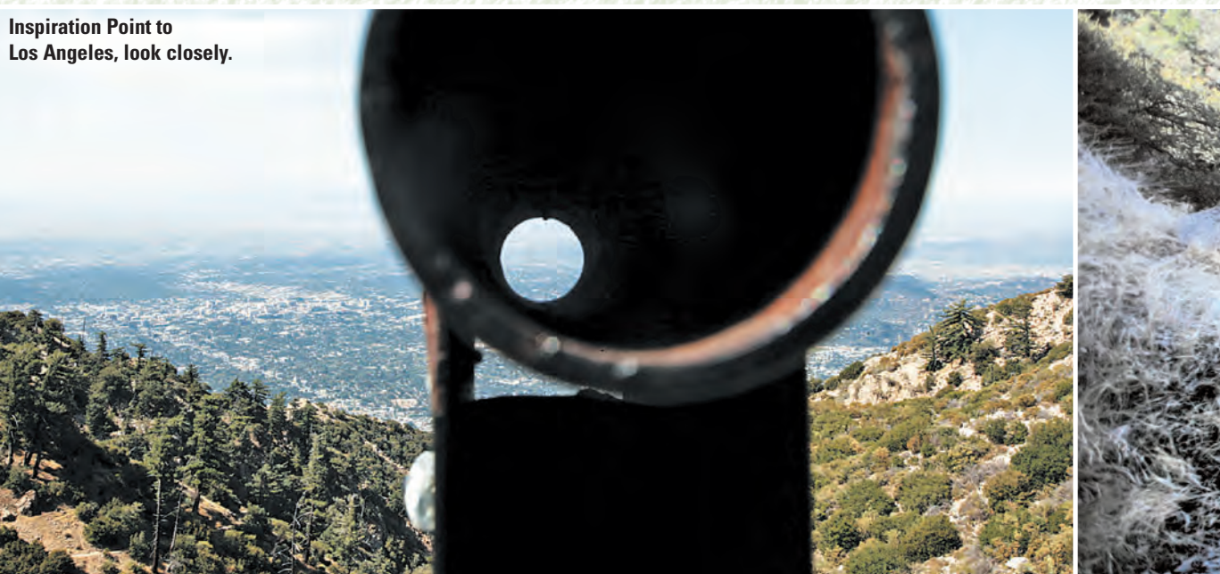
Inspiration Point to Los Angeles, look closely.