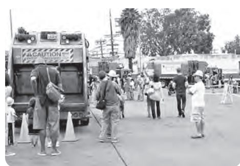
Neighbors enjoyed the truck demonstrations.