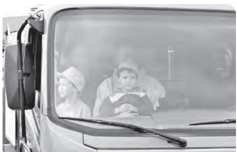
Parents and kids alike enjoyed the truck rides.