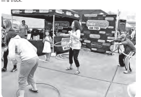
Radio Disney was on hand, conducting hula-hoop contests.