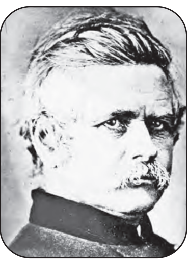
~ Lt. Edward O.C. Ord ~

Until sometime in the 1840s, Los Angeles was unable to define its land boundaries. The story goes that back to the 1780s, when government maps were either lost or misplaced. In 1848, the Ayuntamiento (Mexican Council) in this community asked the Territorial Governor to name a surveyor to determine the boundary lines of this area. His choice was Lt. E.O.C. Ord, U.S. Army, who had recently completed a similar survey in Sacramento. The former Fort Ord in Monterey, Calif., was named in honor of this important Union military figure.