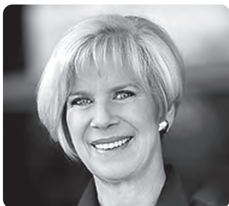
New Congresswoman Janice Hahn.

Congratulations, Janice, from the Club! May you bring as much enthusiasm to those you will represent as you have to the citizens of Los Angeles, and to City Employees.