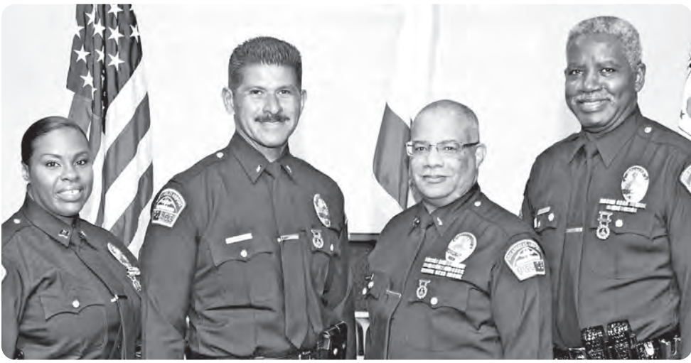
At the Airport Police swearing-in ceremony.