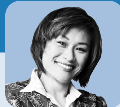
BY TIFFANY SY

Contact me at info@cityemployeesclub.com