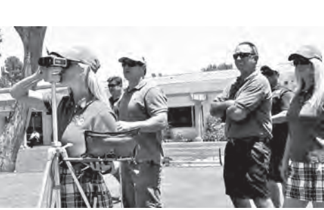
The Pinup Golf Gals and the Cooper family.