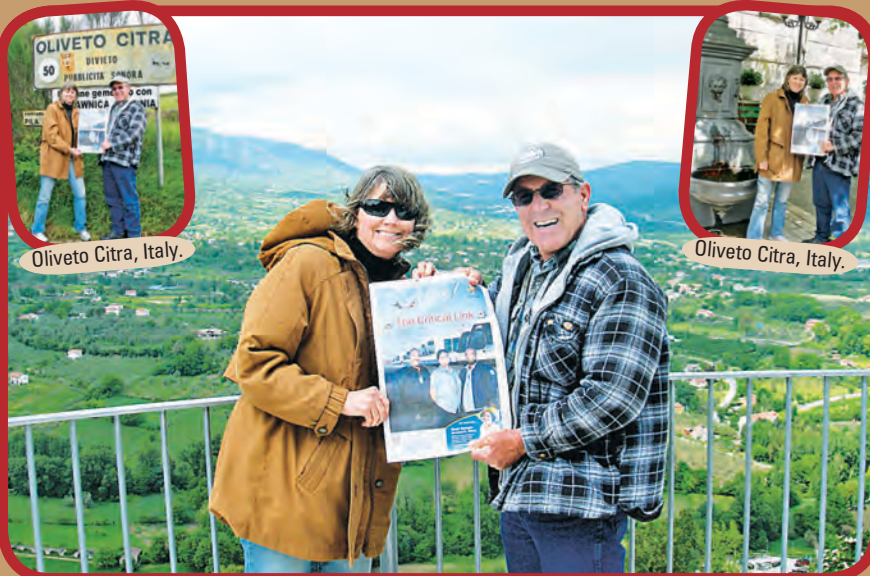
Oliveto Citra, Italy.