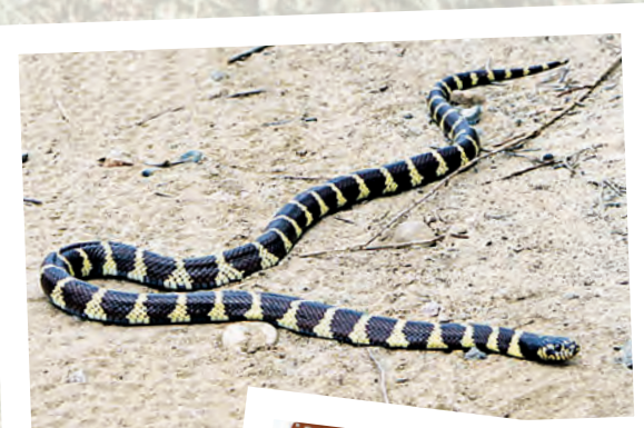
One of the many snakes you may be lucky to see.