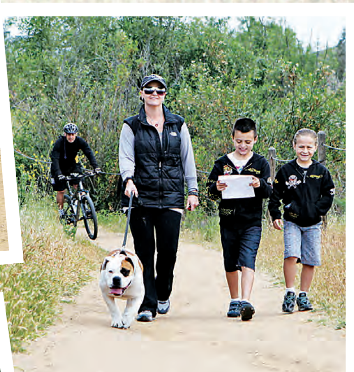
Be careful of bikers along the trail.