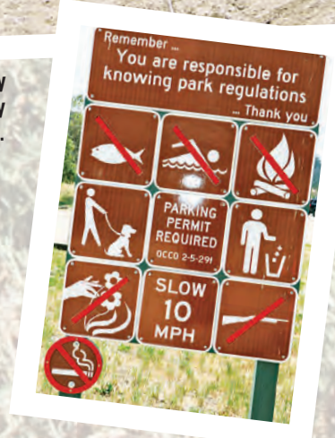
Special park posting.

one of the most relaxing trails I have been on in a few months. You simply follow the trail and find yourself enjoying the great outdoors, looking all around and losing track of time. Everything about the hike is wonderful except for the few bikers with no consideration for safety. I would recommend this hike to all my Club Members and their families.