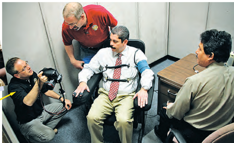
Tom Hawkins, Club Photographer