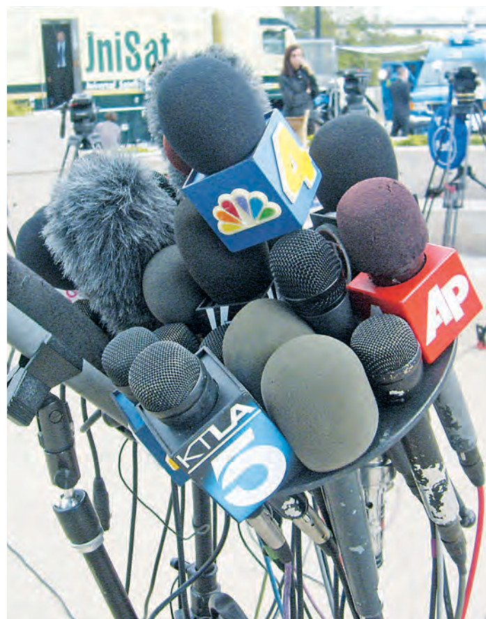
"Here a good photo shot at the Airport Courthouse before a Press Conference. About 100 cameras were there for the Dr. Murray/Michael Jackson case."