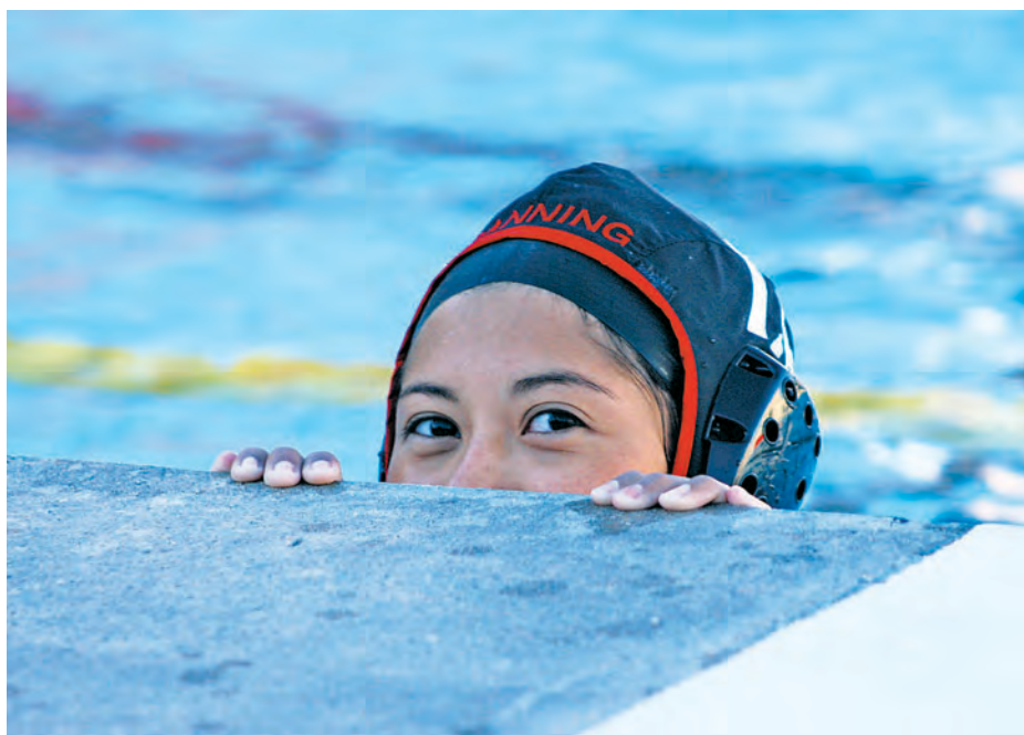
"Here we have a great pic I took at my daughter's last water polo game of the season. She always looks for me in the stands to make sure I am there to cheer her on. I wanted to capture that moment. I think I have a picture I will treasure always."