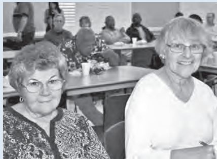
At the RLACEI Spring meeting.