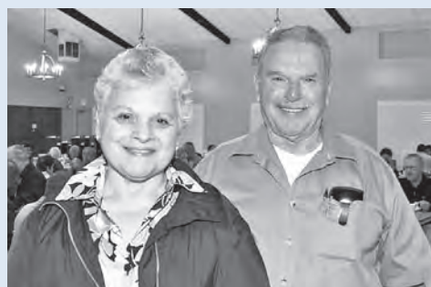
At the RLACEI Spring meeting.