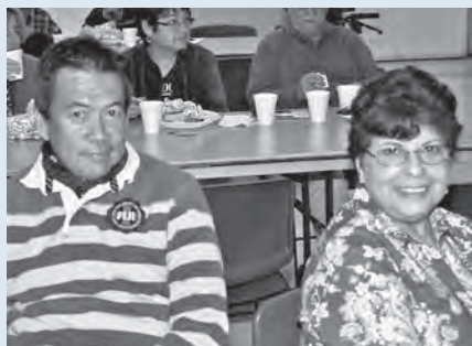
At the RLACEI Spring meeting.