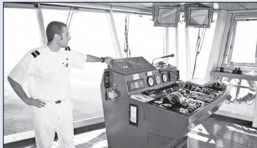
Officer of the watch on the bridge.