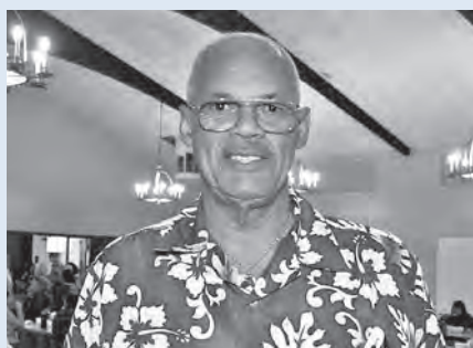
At the RLACEI Spring meeting.