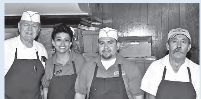
The Chris & Pitts catering team.