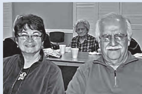
At the RLACEI Spring meeting.