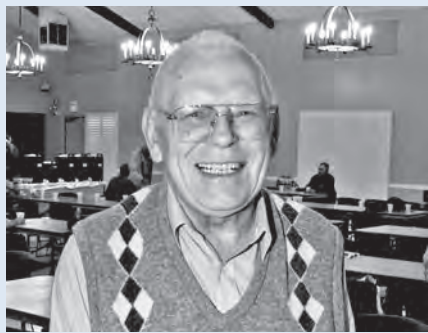
At the RLACEI Spring meeting.