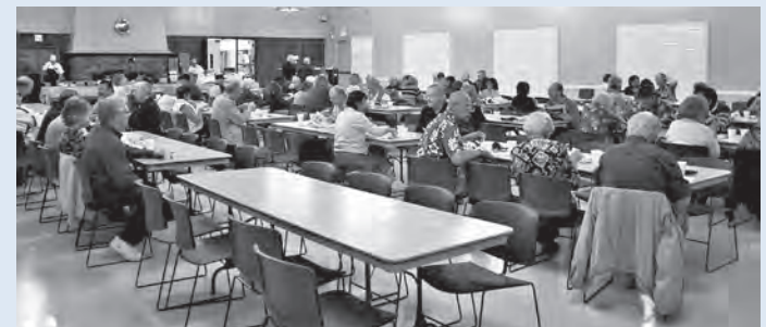
Retirees touch base and catch up.