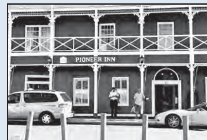
The Pioneer Inn on Maui.

We scheduled to visit the ship's bridge by invitation of the captain, for the next day. We