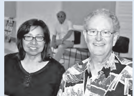
At the RLACEI Spring meeting.