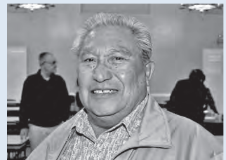
At the RLACEI Spring meeting.