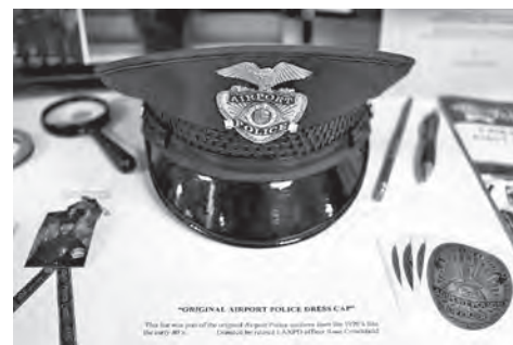
Original Airport Police dress cap.