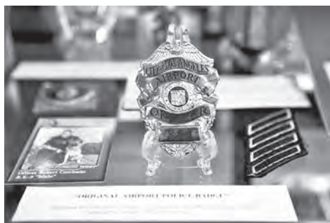
Original Airport Police badge.