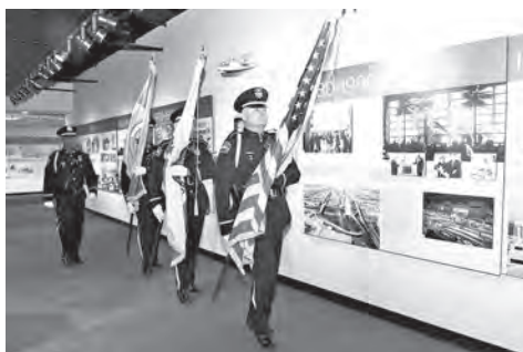
Color Guard marches in.