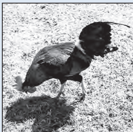
The famous Kauai Chickens.