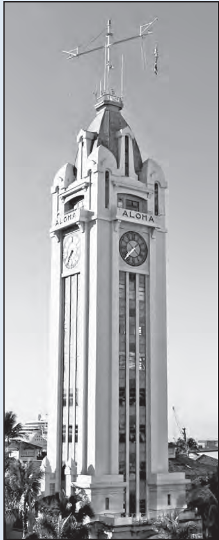
The Aloha Tower in Honolulu harbor.