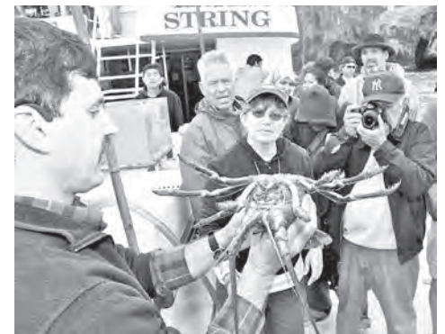
On a previous "Catalina Above and Below" excursion.

Cabrillo Marine Aquarium is at 3720 Stephen M. White Dr. in San Pedro. For reservations, further information, or to receive a calendar of events, call (310) 548-7562 or go to www.cabrillomarineaquarium.org .