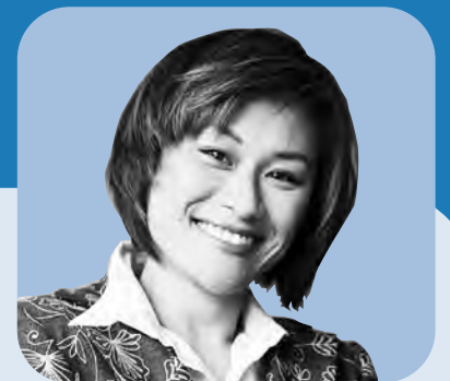
BY TIFFANY SY

Contact me at info@cityemployeesclub.com