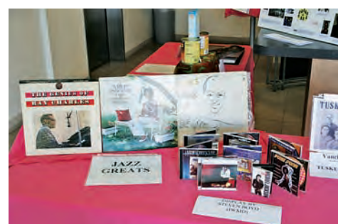
"Jazz Greats," by Steven Boyd.