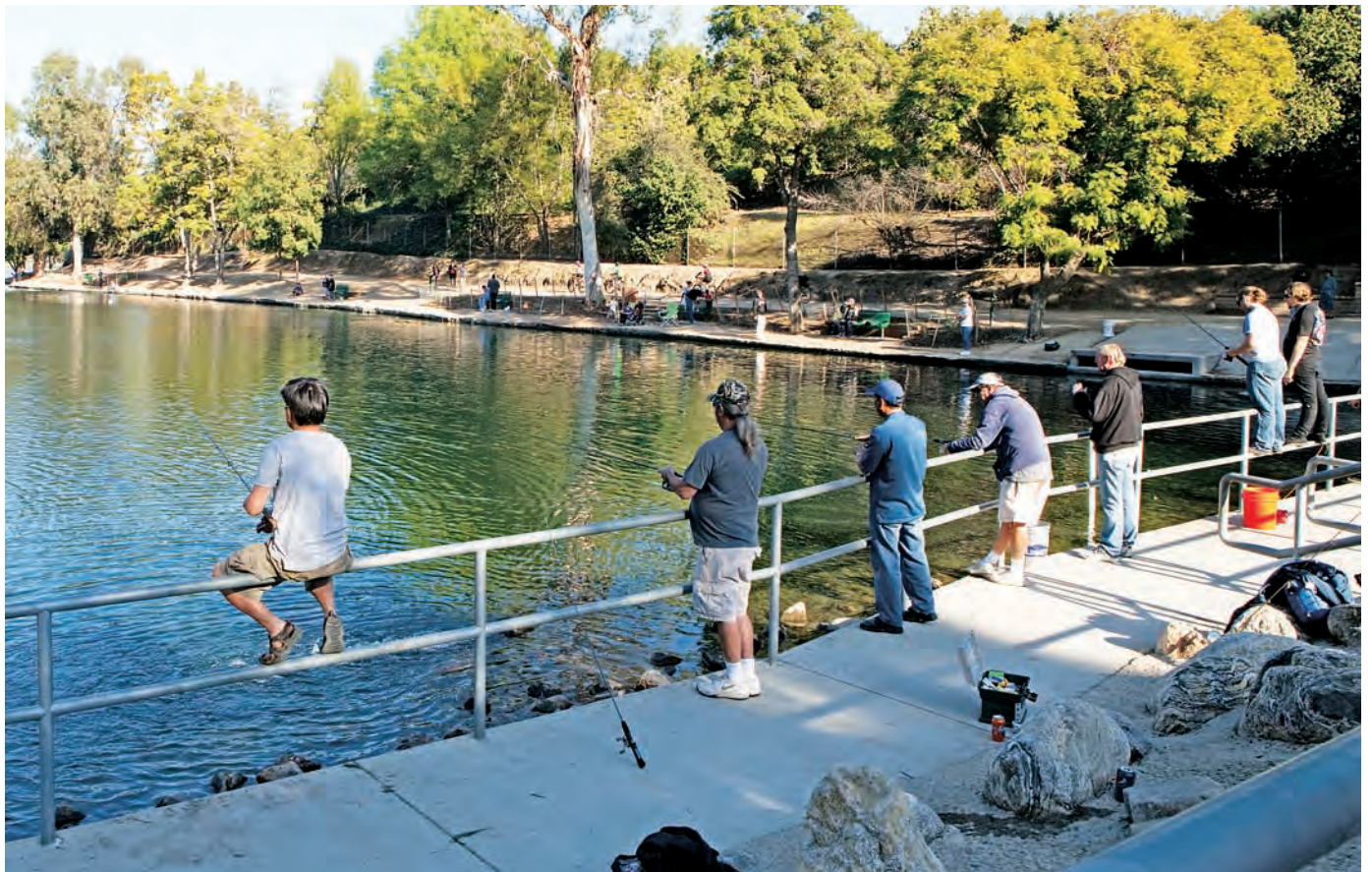
Fishing in Laguna Lake.

When you reach Laguna Road and the trail appears to come to an abrupt stop, cross the road and follow Morelia Place (directly across the street from the trail) for