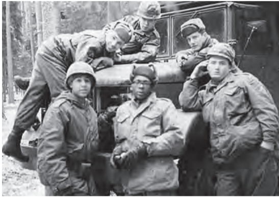
"I'm the one leaning over the truck."

"Here are photographs of my Artillery Battalion three miles from Czechoslovakia in 1968. We had to stay out in a mountainous forest for three weeks until the alert was called off. We had two Sergeant Missiles armed with nuclear warheads ready to fire [upon] President Johnson's command. Thank God nothing ever came of it."