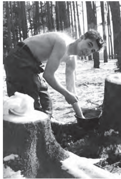
"Bathing out of my helmet, was the only option I had."

Do you have a military memory? Send in a few paragraphs and a few pictures to talkback@cityemployeesclub.com