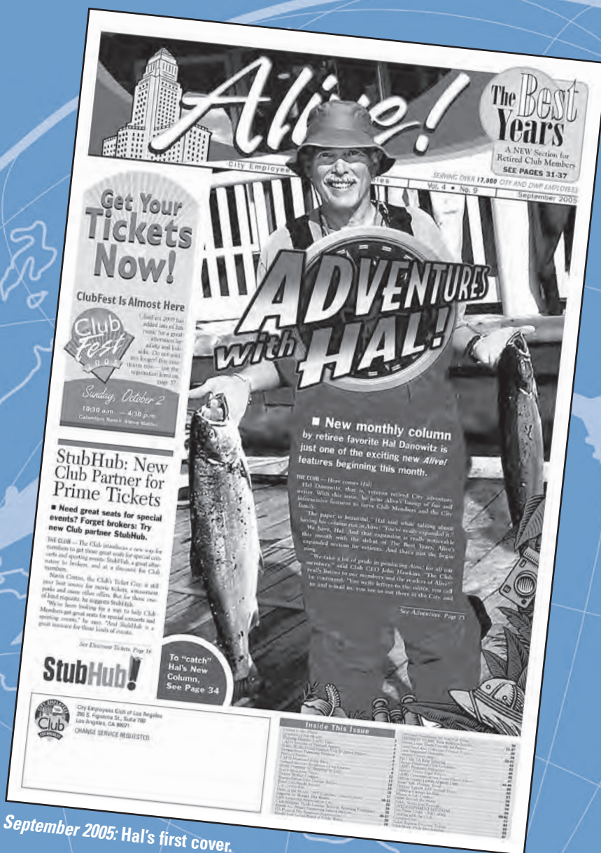
September 2005: Hal's first cover.