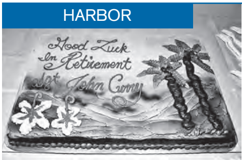
The retirement cake.