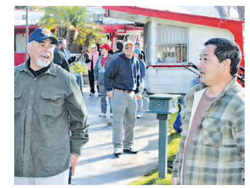
A little smack talk on the course never hurt anyone... much