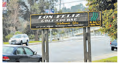
This year's tournament took place at Los Feliz Golf Course.

Rec and Parks hosts annual golf tournament.