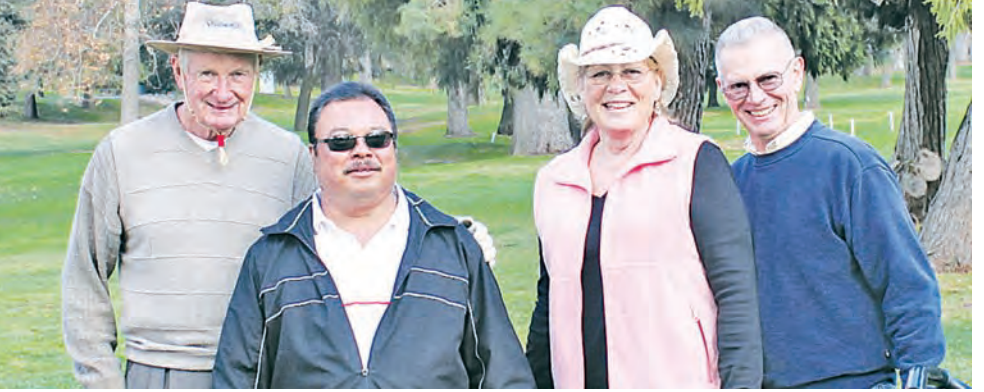
The first group prepares to do battle with the course.